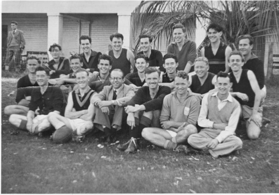
PTC School of Architecture football team 1952